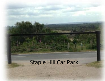
Staple Hill Car Park

Cross the busy road to enter the south eastern side of the common descending downwards using the banked stepped pathway.