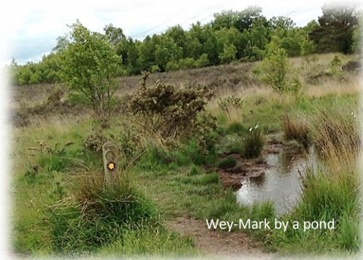
Way-Mark by a pond

Continue until you reach a way-mark by a pond. There, leaving the main path turn right going over the rise and take a sharp turn left at the next intersection to once more pass under the overhead power cables reaching a main pathway, which runs between Gracious Pond Road and Staple Hill. Evidence of the distinctive grey sandy soil can be seen.