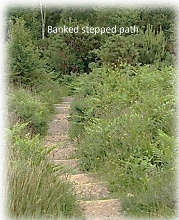
Banked stepped path

Chobham Common is recognised across Europe for its variety of bird life with over a 100 different species having been recorded here. Additionally it is a premier site for ladybirds, bees, wasps and dragonfly and also a medieval earthwork known as 'The Bee Garden'.