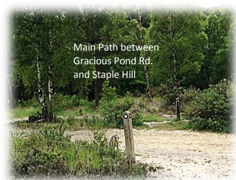
Main Path between Gracious Pond Rd. and Staple Hill

Continue directly across and follow the shaded pathway into woods passing a pond and bearing right to arrive at a right-hand turn to cross an iron footbridge.